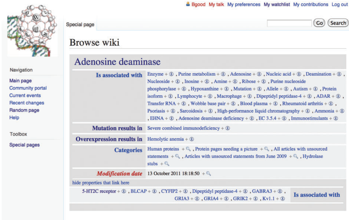
Figure 5. Semantic Media Wiki browse by properties feature accessible in Gene Wiki+. Displaying semantic content from article about adenosine deaminase.

hemolytic anemia (Figure 5). Second, the relationship can be used in queries such as ‘list all the genes whose overexpression results in hemolytic anemia’. These semantic features are enabled as default behaviors of the Semantic Media Wiki system and hence accessible through the Gene Wiki+ instance. In addition, the semantic relationship type for the SWL is brought over and encoded as a Semantic Media Wiki Property. This allows Gene Wiki+ users to view its textual definition and to navigate to related properties within external vocabularies.